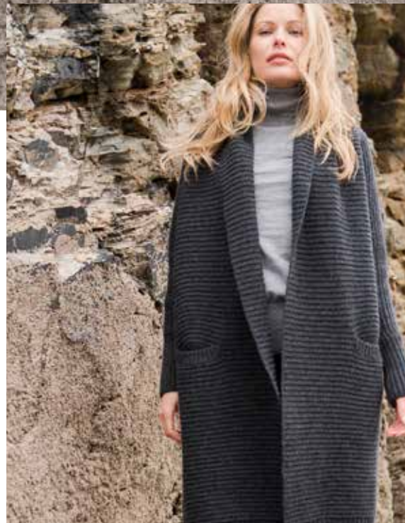
Collar Coatigan £155 Merino Roll Neck £78 Gaberdine Leather Leggings £295 High Top Trainers £130 Cashmere Rib Beanie £65