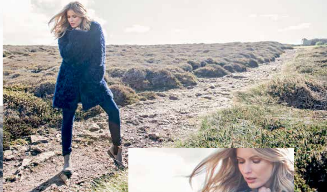
Reversible Curly Coat £1,100 Punched Sheepskin Chelsea Boots £165