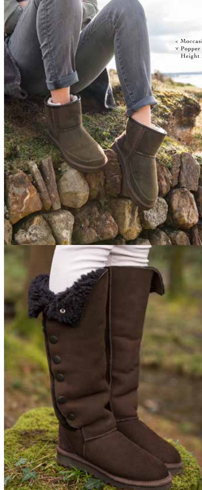
< Moccasin Shortie £140 v Popper Boots – Knee Height £210