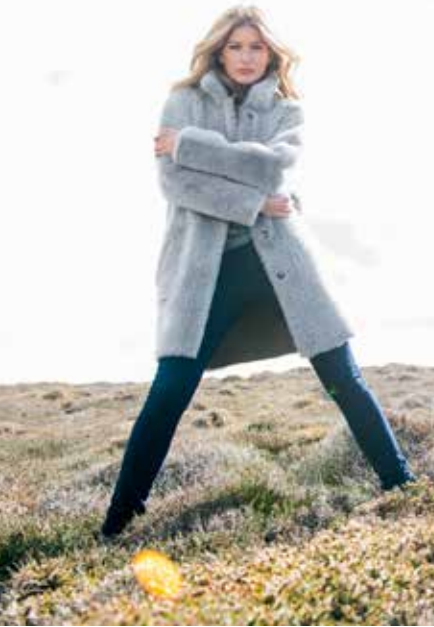
Reversible Sheepskin Teddy Coat £1,100 Fine Knit Merino Crew-neck £70