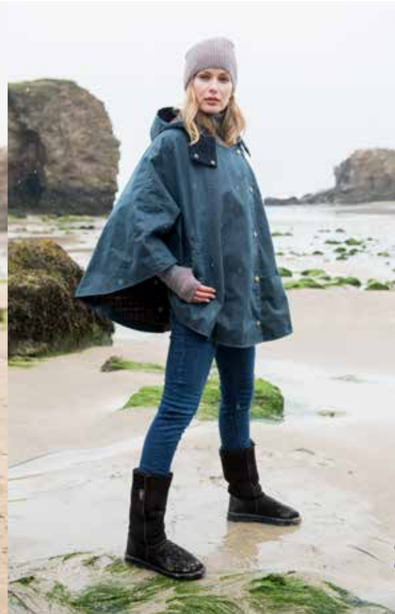
Waxed Cotton Cape £185 Cashmere Rib Beanie £65 Cashmere Wristwarmers £36 Aqualamb Boots – Calf Height £165