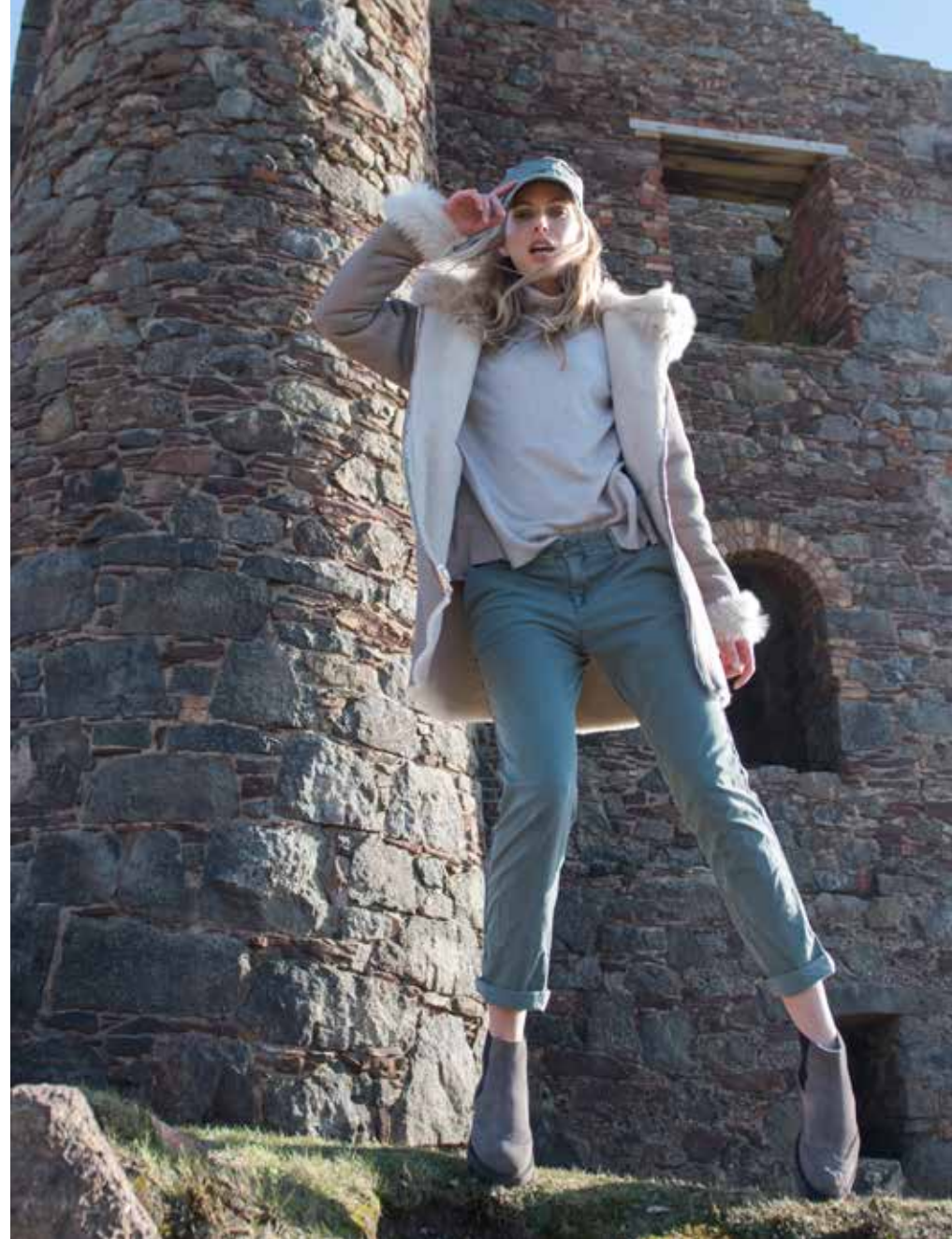
Reversible Sheepskin Parka £1,150 Slouchy Fine Knit Roll Neck £88 Punched Sheepskin Chelsea Boots £165