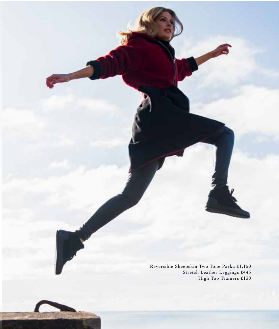
Reversible Sheepskin Two Tone Parka £1,150 Stretch Leather Leggings £445 High Top Trainers £130