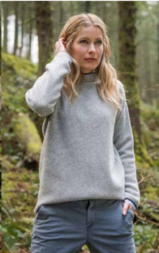
Felted Funnel Neck Jumper £82