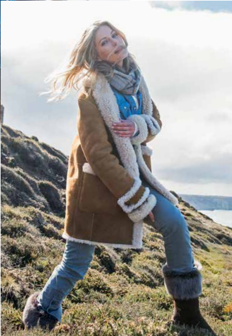
Vintage Box Sheepskin Coat £1,100 Lambswool Tartan Scarf £35 Toscana Boots £215