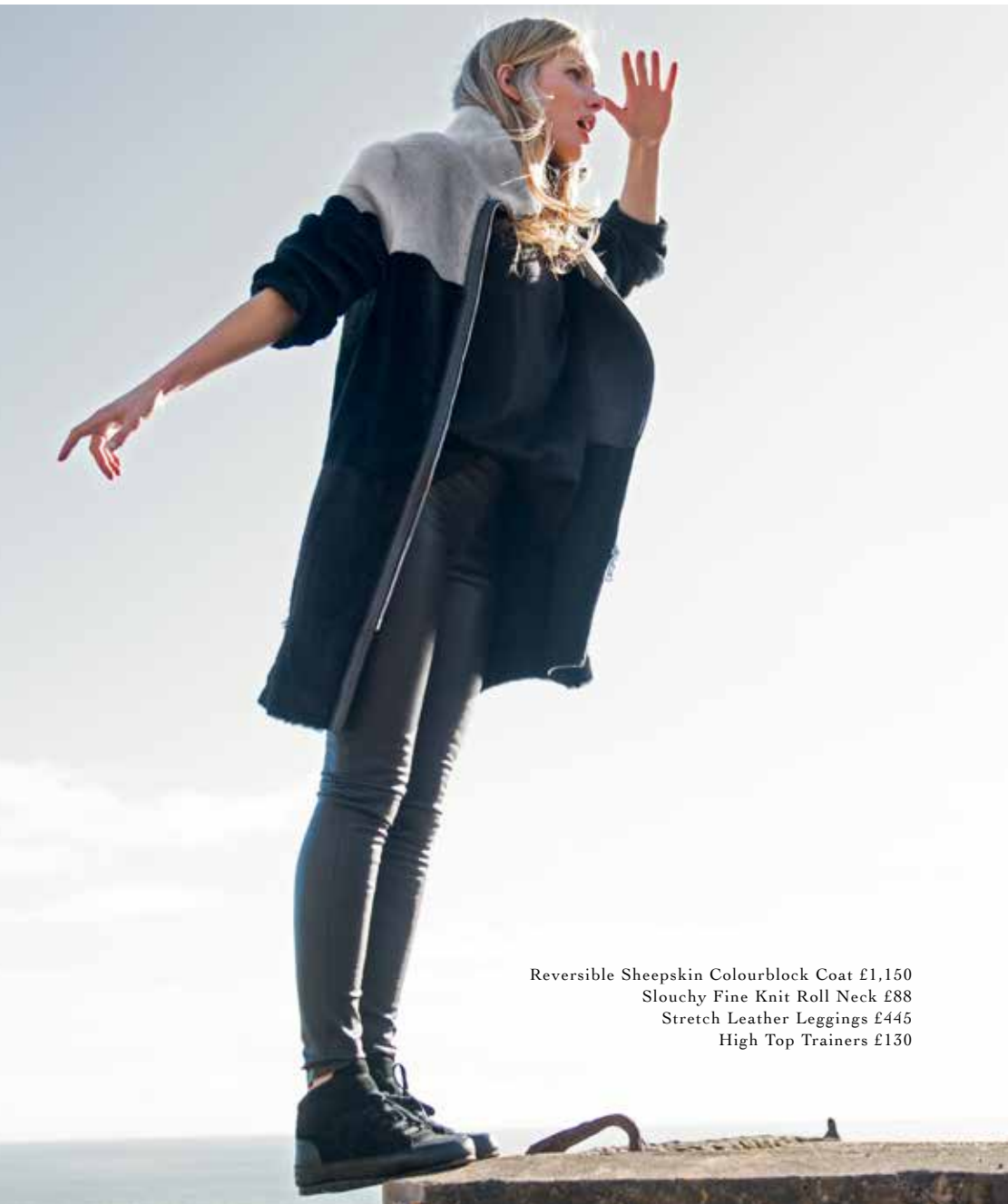
Reversible Sheepskin Colourblock Coat £1,150 Slouchy Fine Knit Roll Neck £88 Stretch Leather Leggings £445 High Top Trainers £130