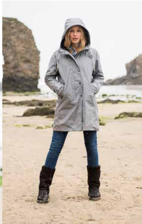
Waxed Cotton Parka £198 Aqualamb Boots – Calf Height £165

WEATHER THE STORM WITH OUR OVERSIZED WAX COVER-UPS AND AQUALAMB SHEEPSKIN BOOTS