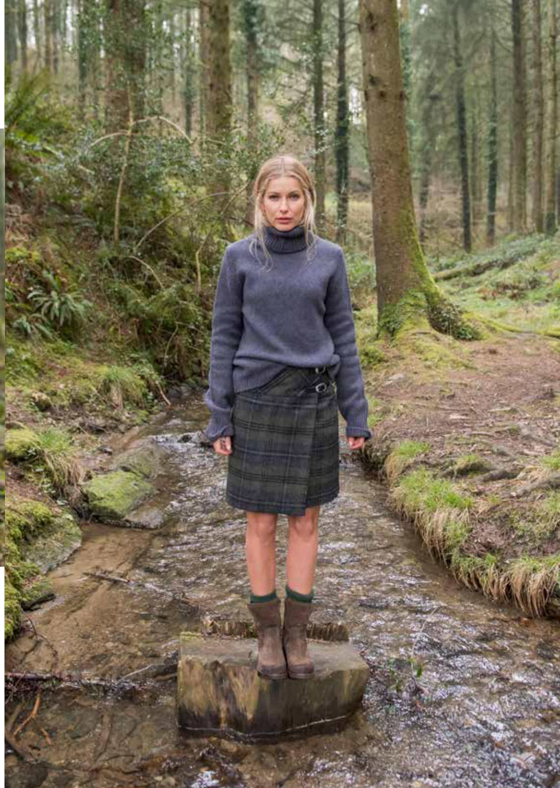
> Roll Neck Slouch Jumper £135 The Celt Kilt £98 Essential Leather Ankle Boots £145 Ladies Walking Socks £20