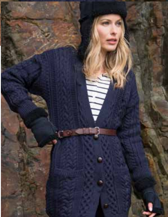
Cable Boyfriend Cardigan £99 Organic Cotton Henley £40 Aviator Boots – Regular Height £165 Ladies Walking Socks £20 Sheepskin Trapper Hat £90 Sheepskin Wristwarmers £55