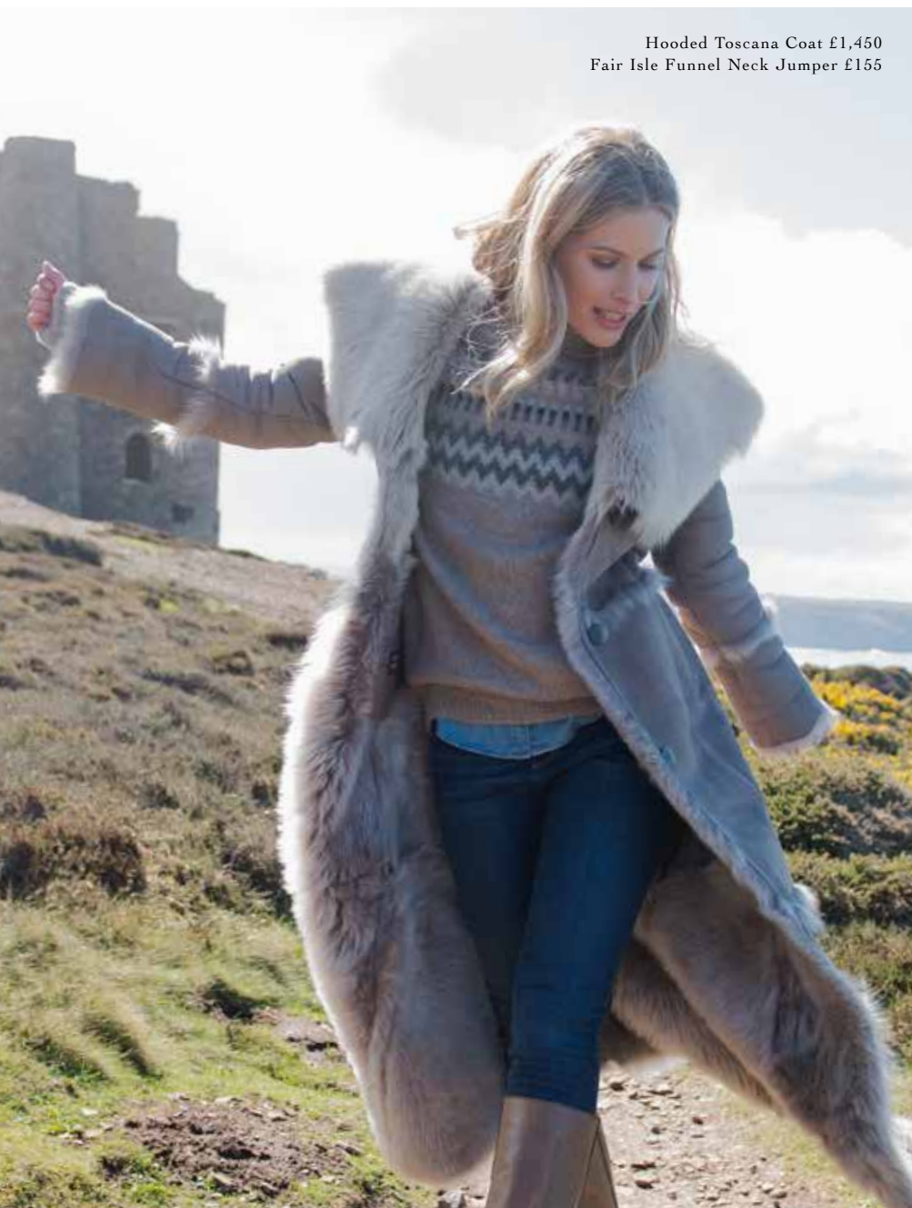
Hooded Toscana Coat £1,450 Fair Isle Funnel Neck Jumper £155