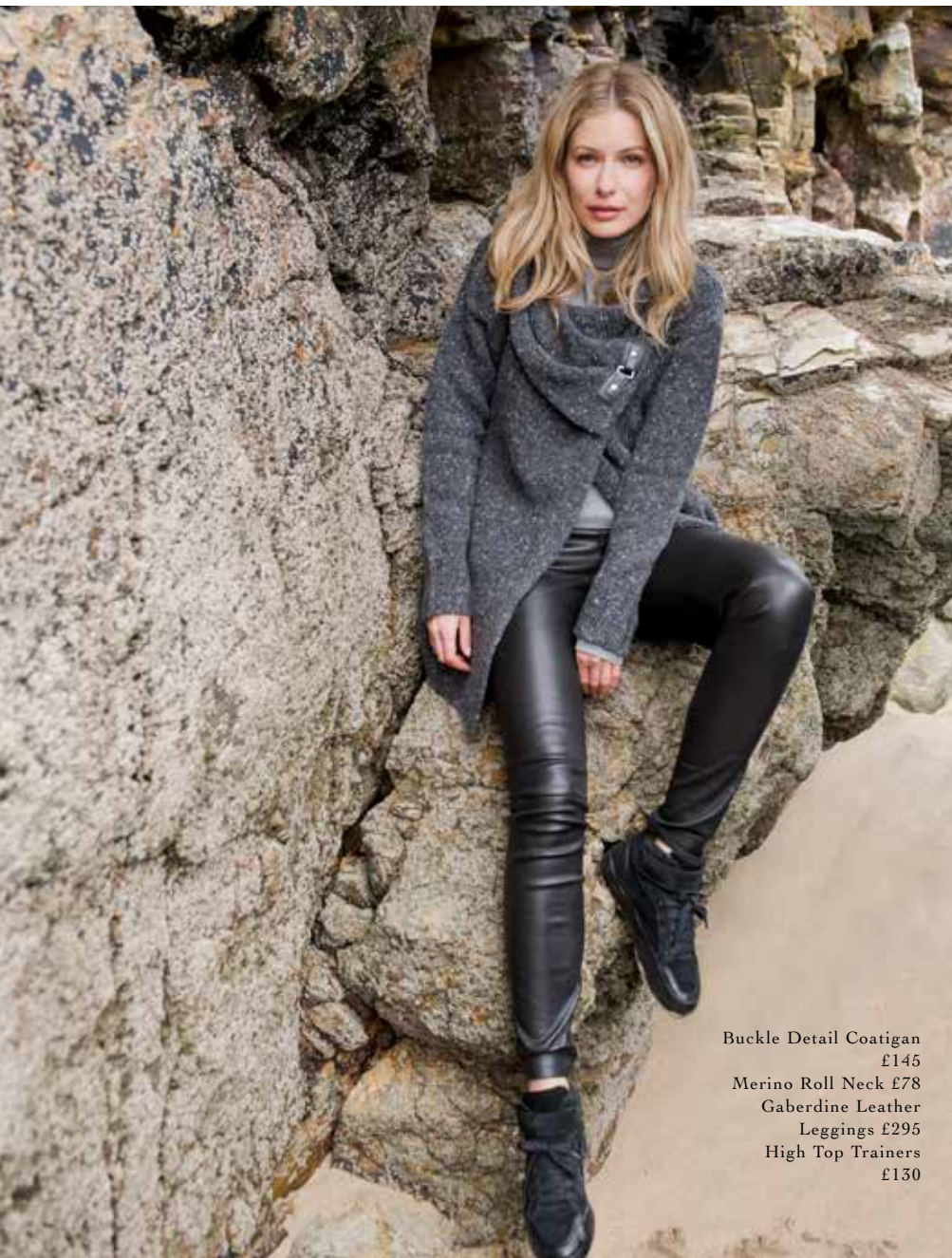
Buckle Detail Coatigan £145 Merino Roll Neck £78 Gaberdine Leather Leggings £295 High Top Trainers £130