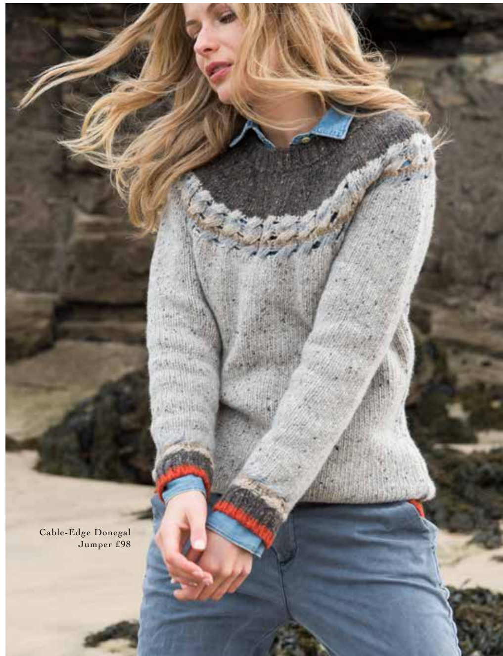
Cable-Edge Donegal Jumper £98