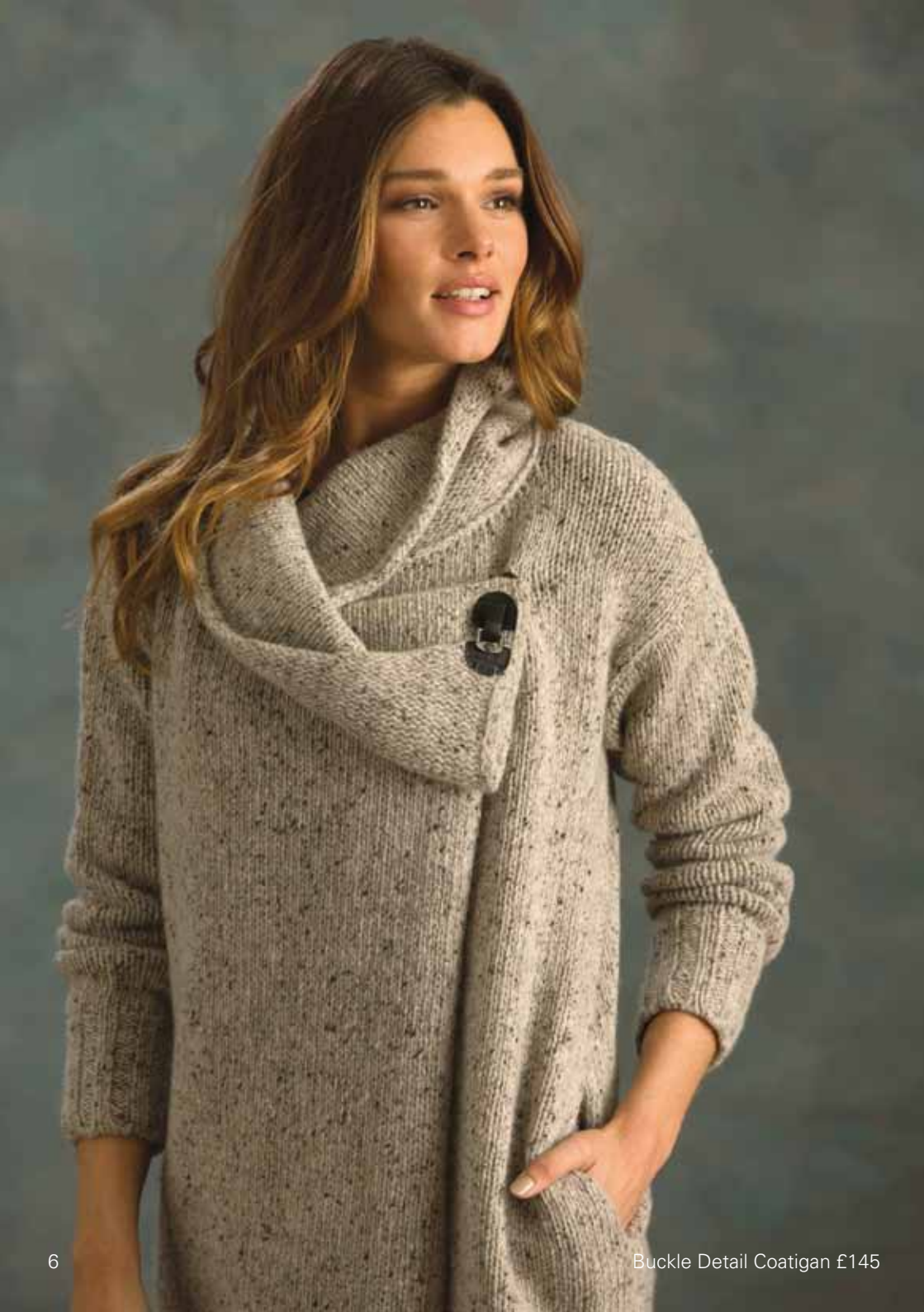
Buckle Detail Coatigan £145