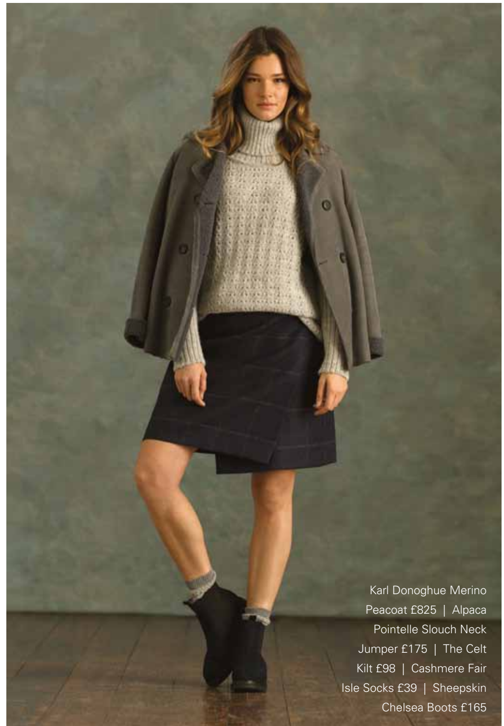
Karl Donoghue Merino Peacoat £825 | Alpaca Pointelle Slouch Neck Jumper £175 | The Celt Kilt £98 | Cashmere Fair Isle Socks £39 | Sheepskin Chelsea Boots £165

Celtic & Co have teamed up with renowned London-based designer, Karl Donoghue, to produce an exclusive collaborative range of shearling outerwear. Featuring modern silhouettes and detailing with a classic timeless feel, each piece has been meticulously handcrafted in England using traditional techniques