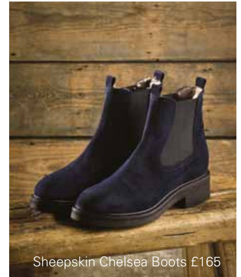
Sheepskin Chelsea Boots £165