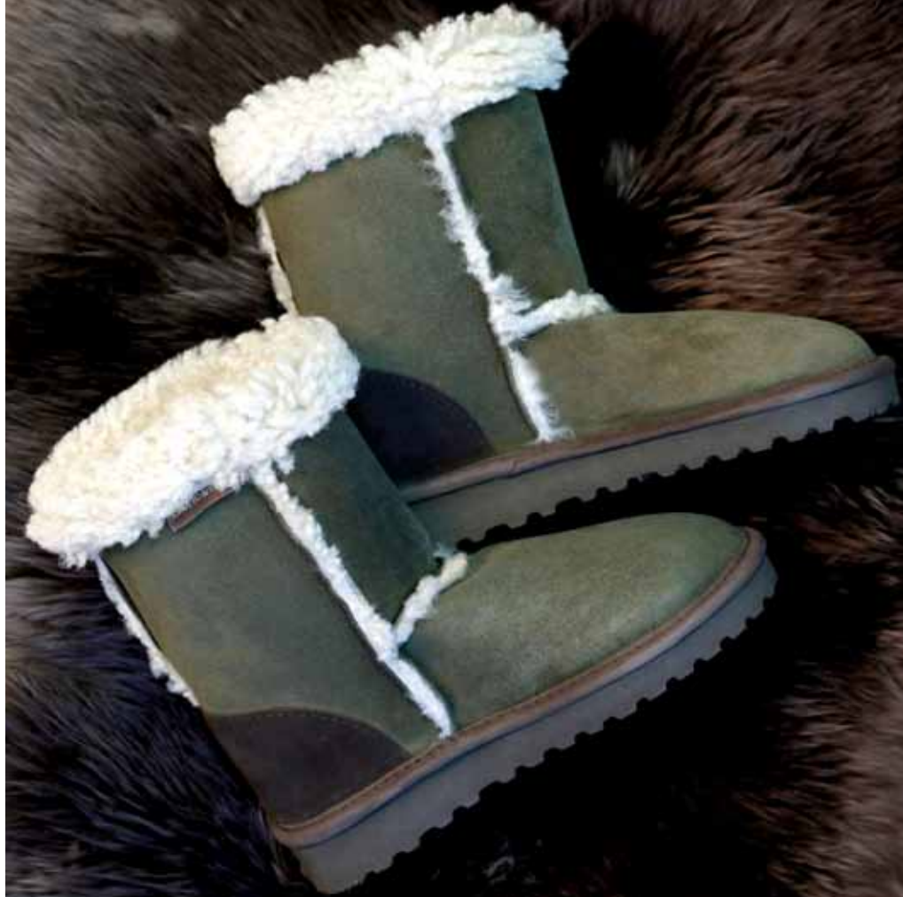
Rustic Boots £145

25 years of excellence – Celtic & Co's 100% British sheepskin footwear is still handcrafted in their workshop in Cornwall using traditional techniques.