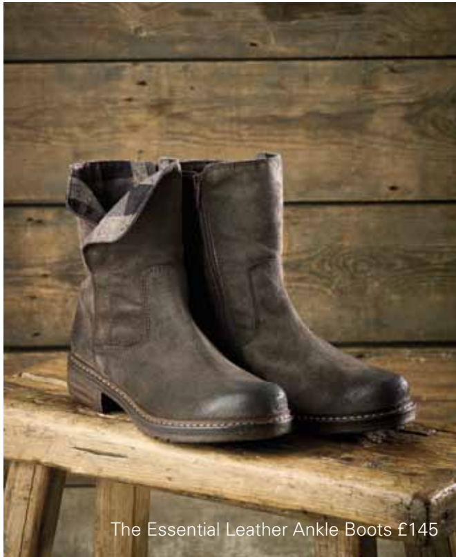
The Essential Leather Ankle Boots £145