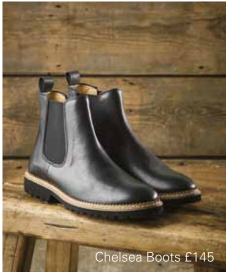
Chelsea Boots £145