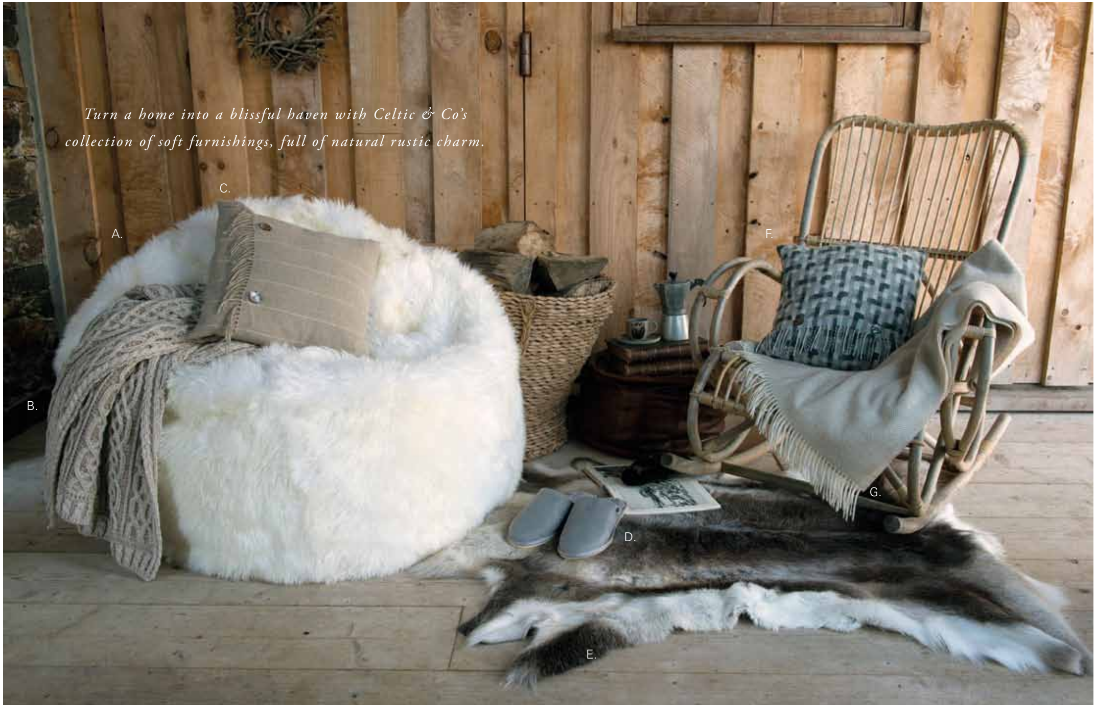
A. Large Sheepskin Beanbag £785 | B. Cable Plaited Blanket £75 | C. Merino Cushion £55 | D. Sheepskin Mules £52

Turn a home into a blissful haven with Celtic & Co's collection of soft furnishings, full of natural rustic charm.