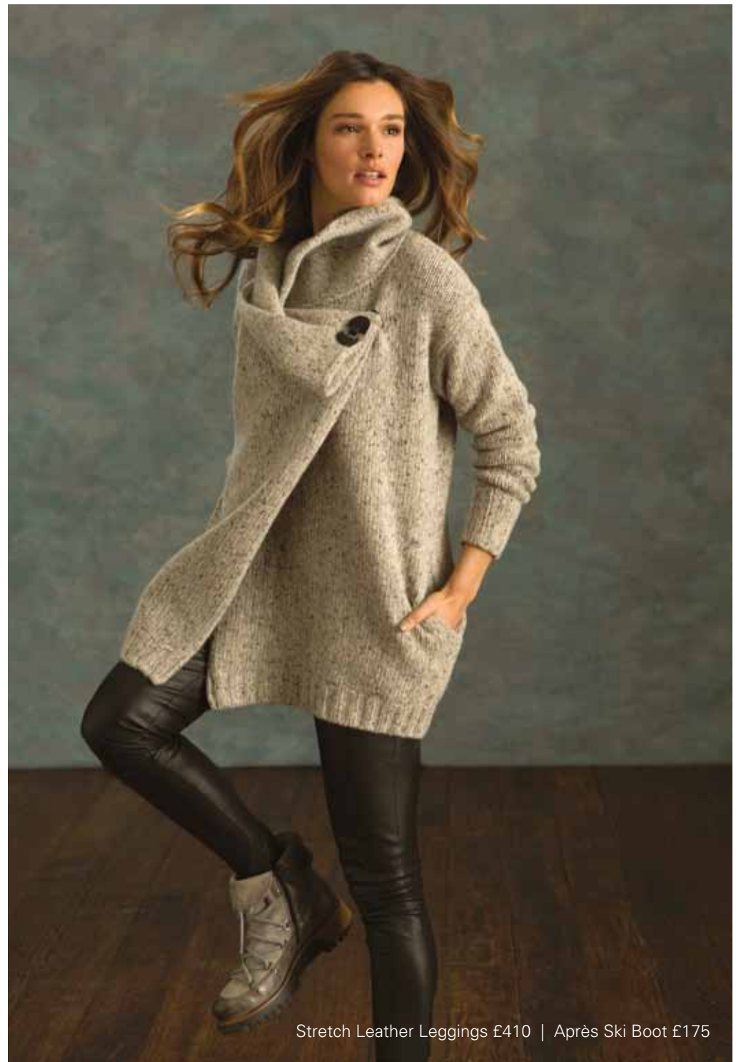
Stretch Leather Leggings £410 | Après Ski Boot £175