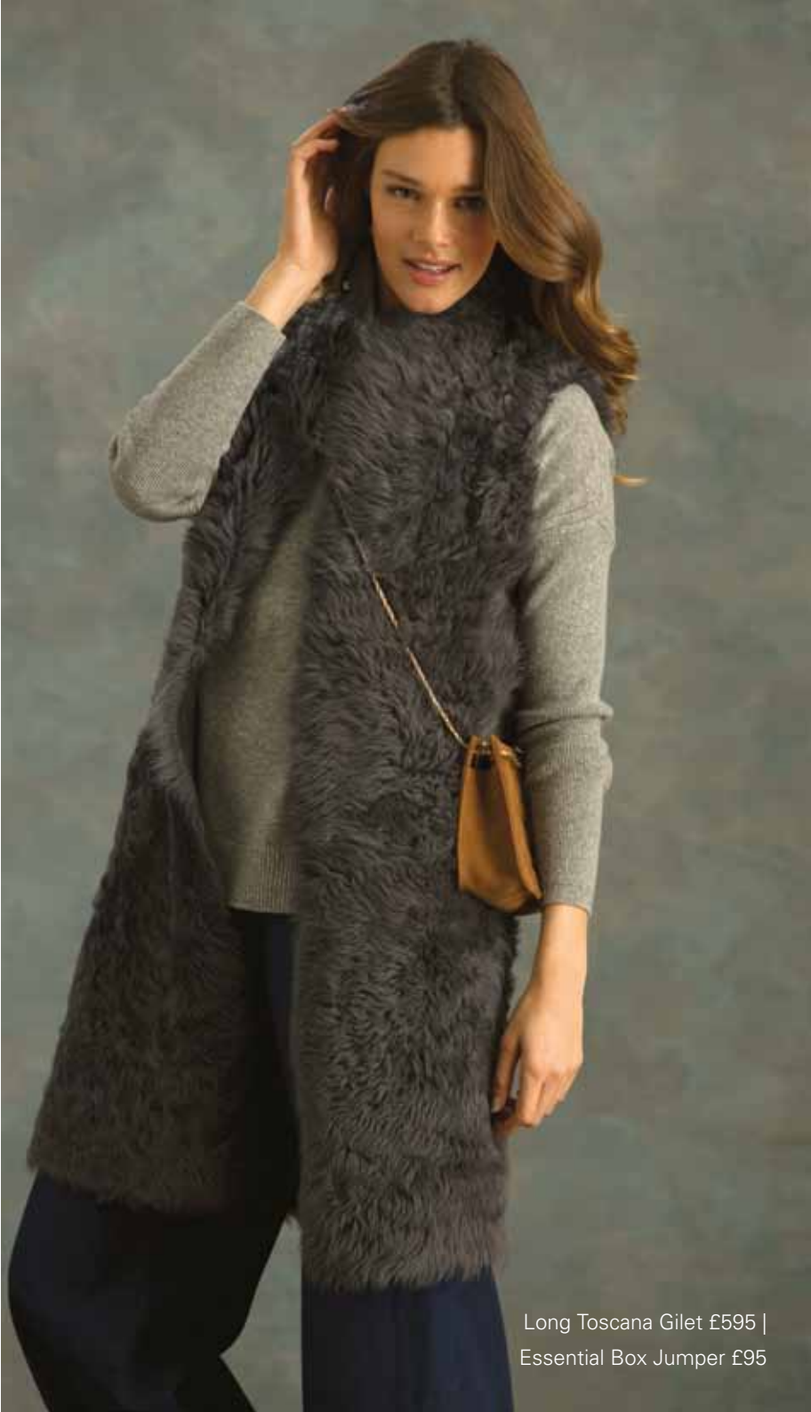
Long Toscana Gilet £595 | Essential Box Jumper £95