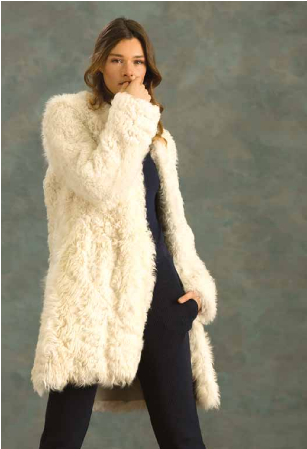
Reversible Curly Coat £1,100 | Merino Roll Neck £78