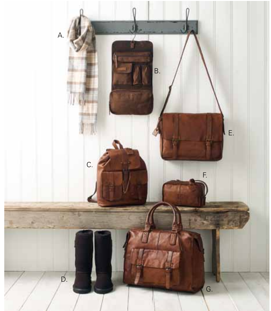
A. Lambswool Tartan Scarf £30 | B. Hanging Washbag £55 | C. Leather Backpack £180 | D. Aqualamb Sheepskin Boots £165 | E. Leather Messenger Bag £142 | F. Leather Wash Bag £66 | G. Leather Holdall £202

Accessorise with nature's finest – sheepskin, leather and lambswool