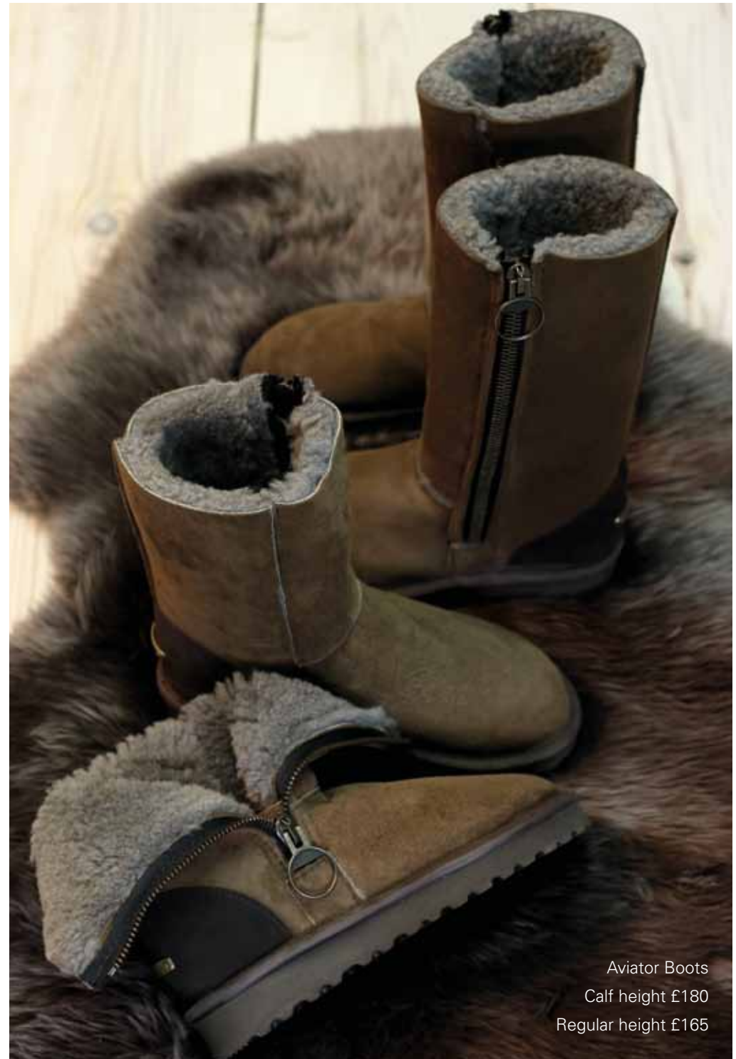
Aviator Boots Calf height £180 Regular height £165