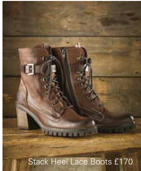
Stack Heel Lace Boots £170