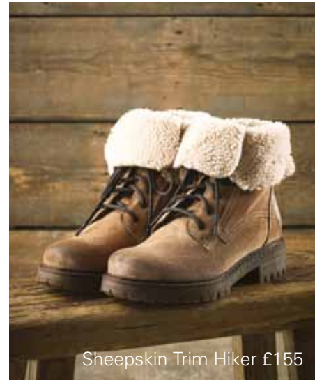
Sheepskin Trim Hiker £155