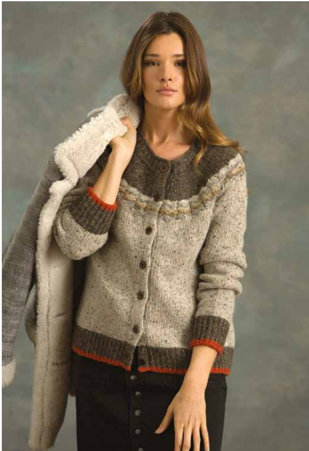
The Printed Coat £1,100 | Cable-edge Donegal Box Cardigan £145 | Ladies Walking Socks £20 | Chelsea Boots £140