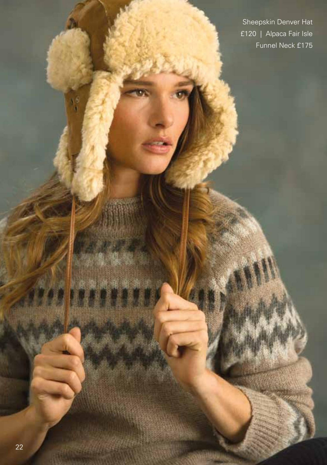
Sheepskin Denver Hat £120 | Alpaca Fair Isle Funnel Neck £175

Accessorise with nature's finest – sheepskin, leather and lambswool