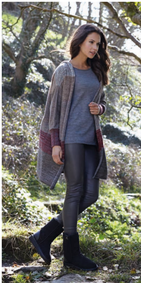
Autumn Hooded Cardi £158 Fine Knit Merino Crew-neck £62 Stretch Leather Leggings £395 Celt Boots – regular height £135