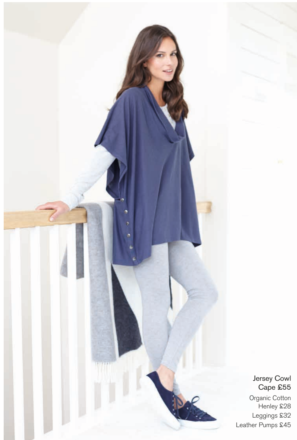
Jersey Cowl Cape £55