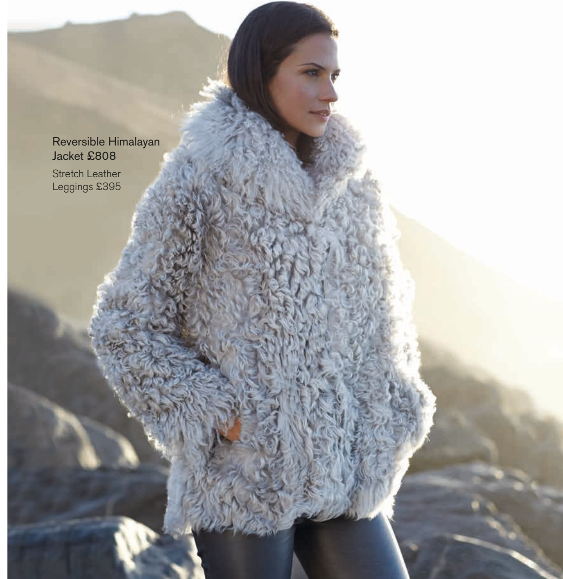
Reversible Himalayan Jacket £808 Stretch Leather Leggings £395

Make a statement with your outerwear this autumn/winter by cossetting yourself in sumptuous shearling. Celtic offers a range of classic and modern designs to treasure for a lifetime. However if you're looking for a standout style, our new Reversible Himalayan Jacket certainly has that wow factor.