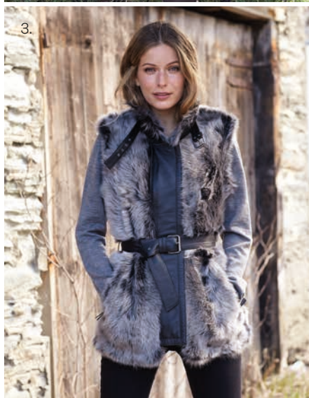
3. Toscana Belted Gilet £525 Fine Knit Merino Crew-neck £62 Skinny Jeans £80