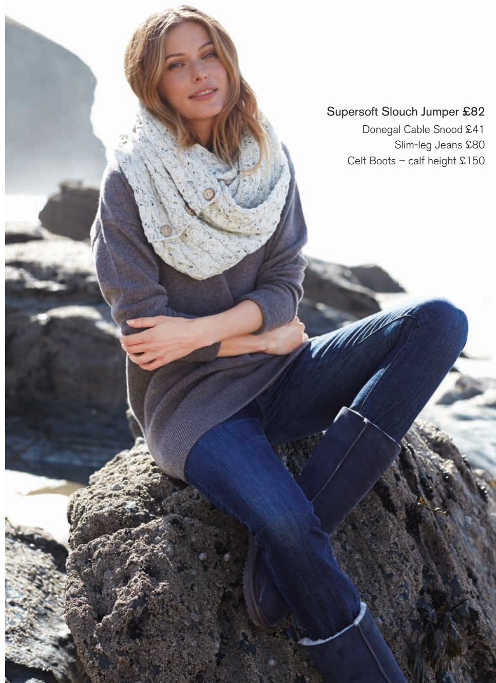
Supersoft Slouch Jumper £82 Donegal Cable Snood £41 Slim-leg Jeans £80 Celt Boots – calf height £150