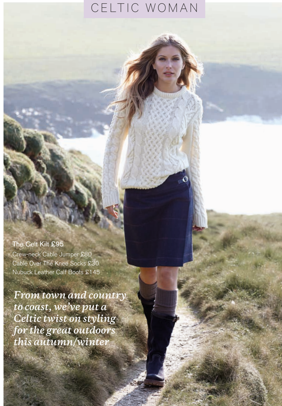
The Celt Kilt £95 Crew-neck Cable Jumper £80 Cable Over The Knee Socks £30 Nubuck Leather Calf Boots £145

From town and country to coast, we've put a Celtic twist on styling for the great outdoors this autumn/winter