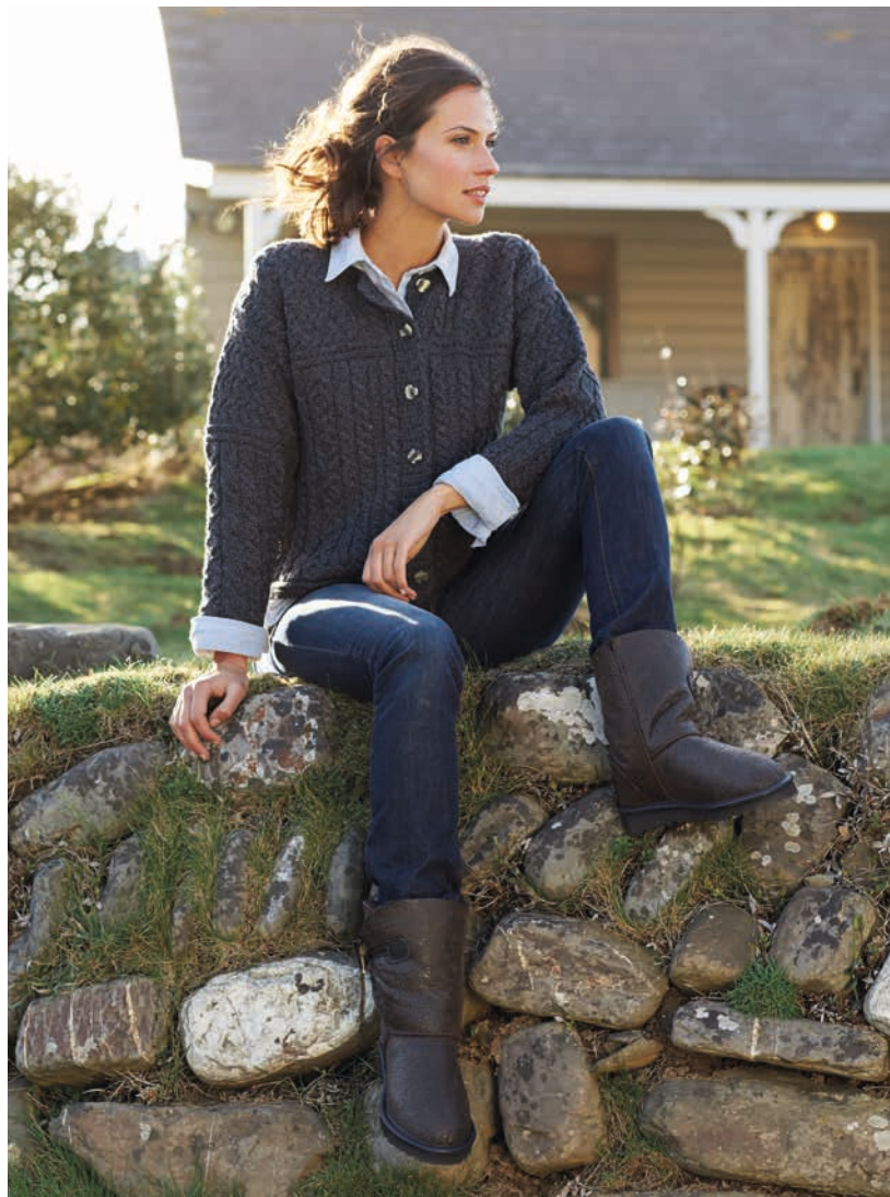
Box Cardi £80 Slim-leg Jeans £80 Toggle Boots £145