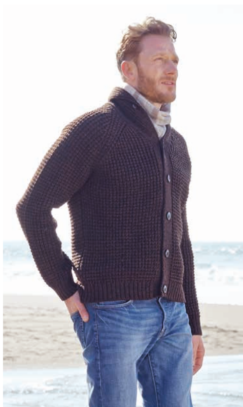
Men's Shawl Collar Cardigan £97 Lambswool Tartan Scarf £30