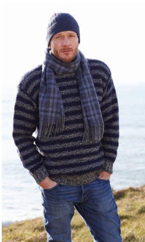
Mens Stripe Jumper £97 Lambswool Tartan Scarf £30 Men's Cashmere Ribbed Hat £59