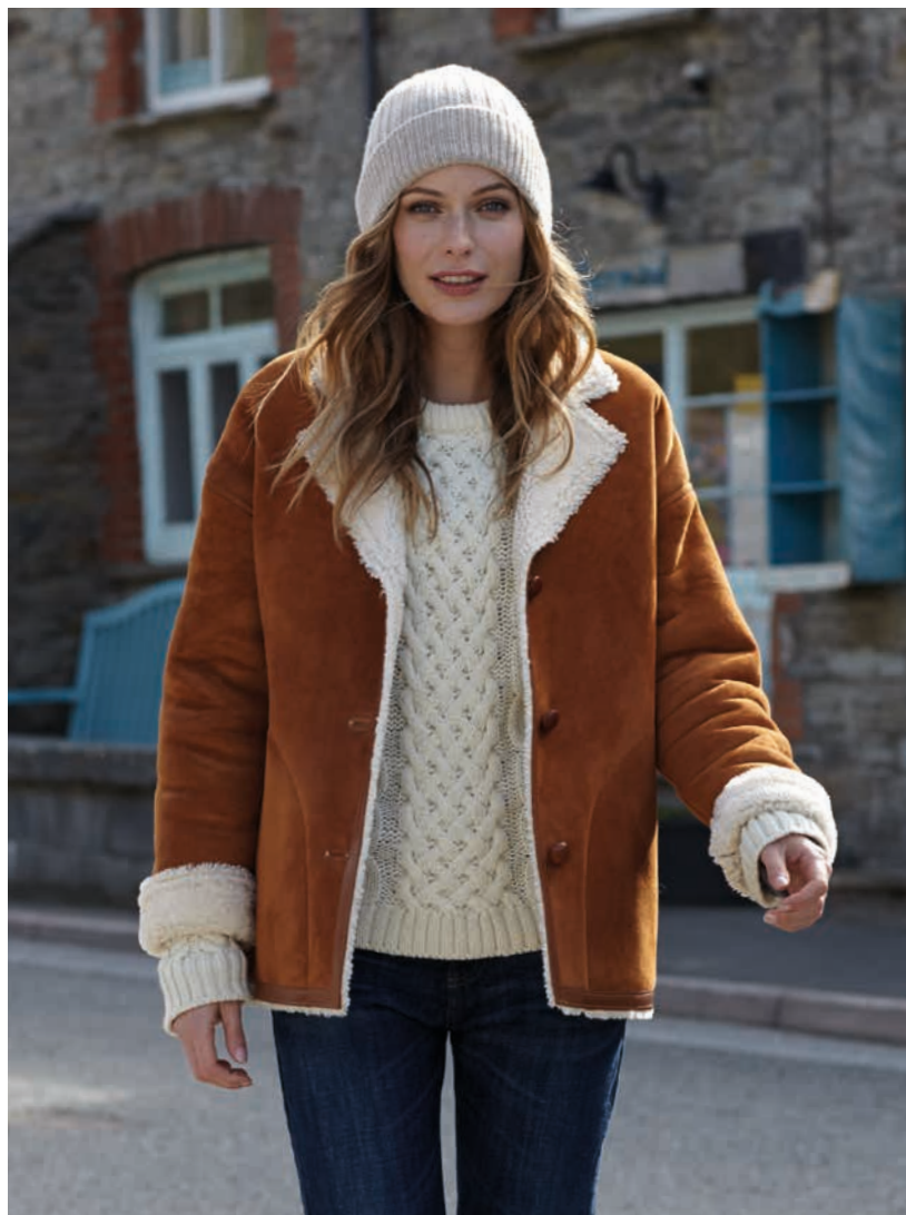
Classic Sheepskin Jacket £799 Cashmere Rib Beanie £60 Crew-neck Cable Jumper £80 Slim-leg Jeans £80