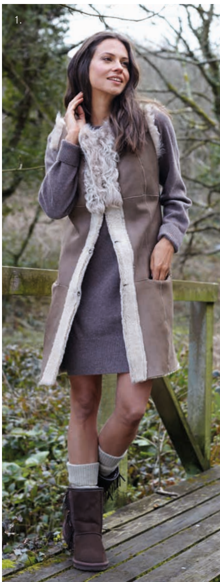
1. Longline Merilino Gilet £586 Supersoft Slouch Dress £95 Ladies' Boot Socks £30 Boho Boots £150