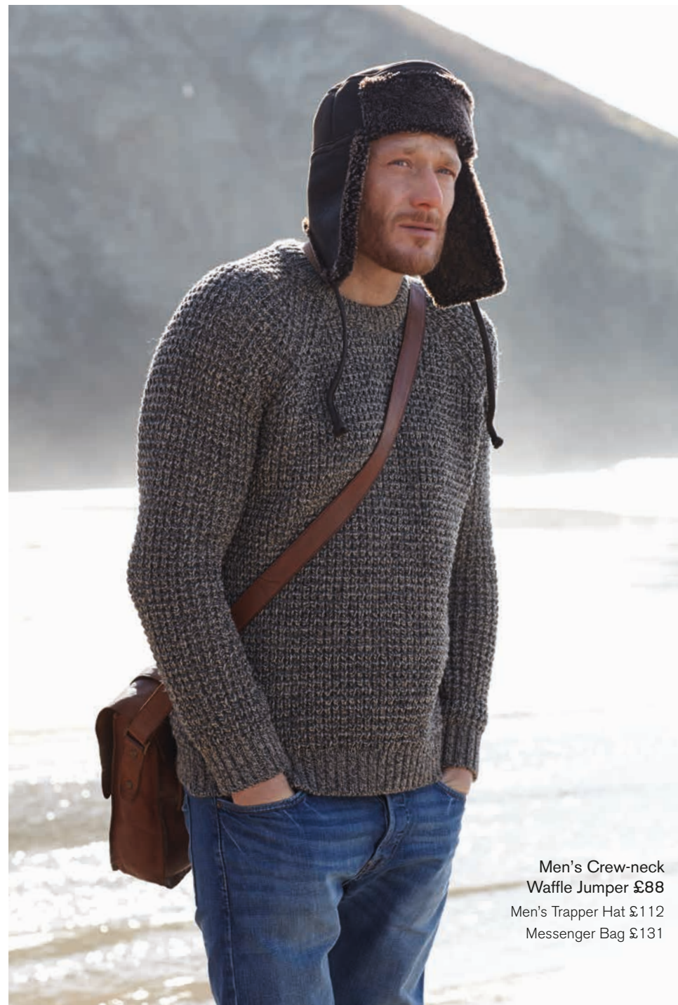
Men's Crew-neck Waffle Jumper £88 Men's Trapper Hat £112 Messenger Bag £131