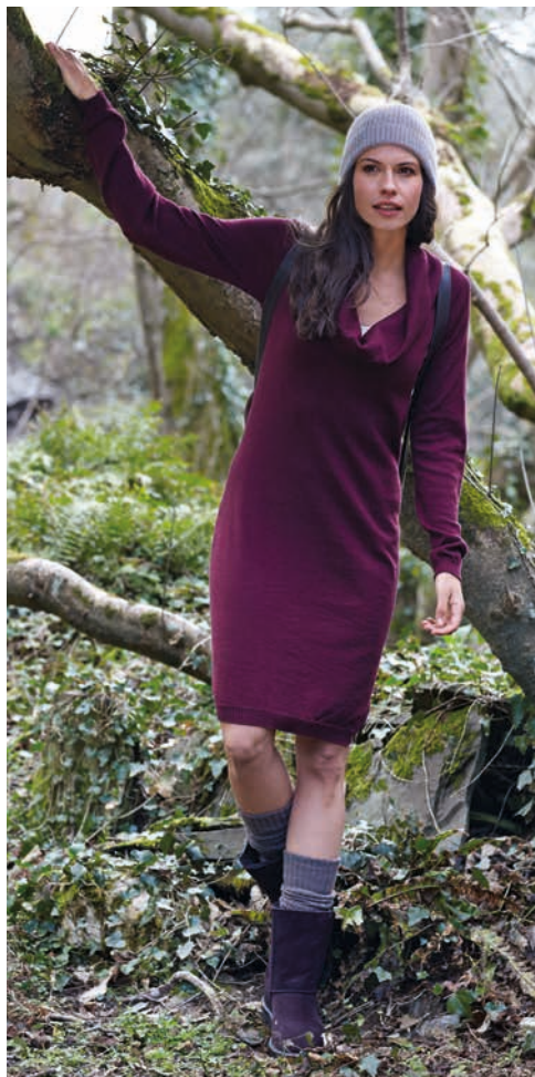
Merino Cowl-neck Jumper Dress £95 Cashmere Rib Beanie £60 Convertible Leather Bag £175 Ladies' Boot Socks £30 Celt Boots – regular height £135